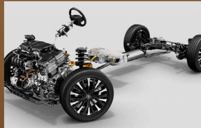
2.5L hybrid system

It absorbs vibrations smoothly to create a unique and comfortable ride for you