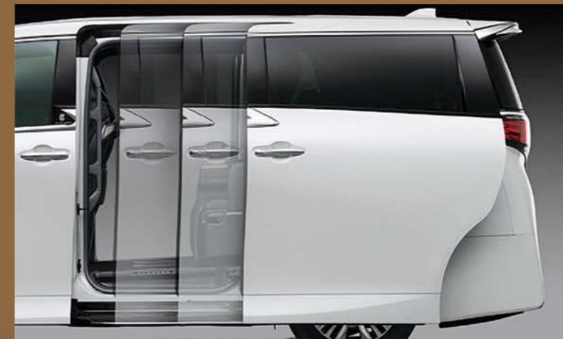
Dual power sliding door (dual easy closer, anti-pinch function, one-touch seesaw switch)