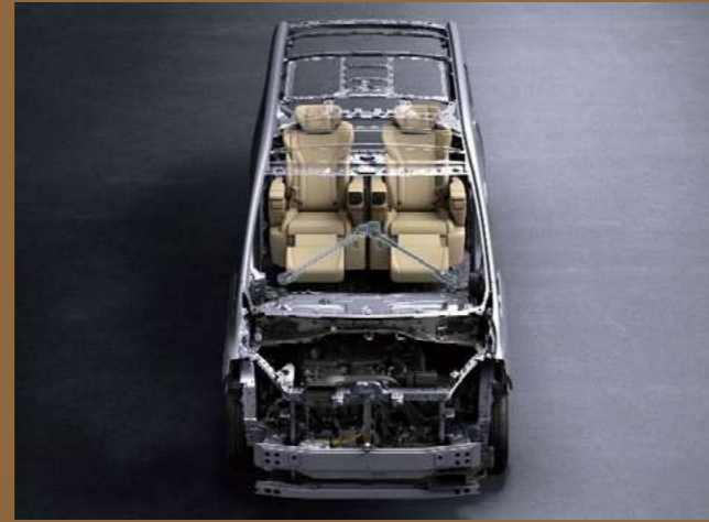
TNGA * platform/high-rigidity body