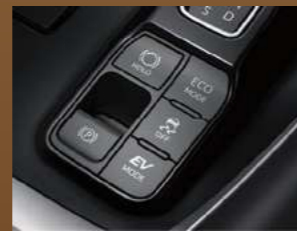
Electric parking brake/brake hold