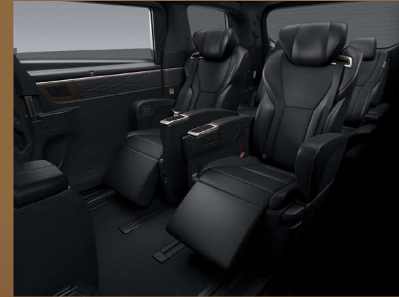
Executive power seat [second seat] A seating experience that is one class above the rest.