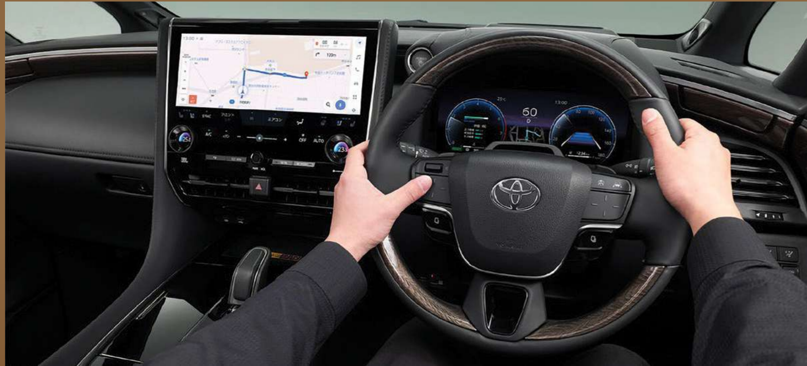
12.3-inch TFT * Color meter + multi-information display (with meter illumination control)

A comfortable cockpit with attention to detail in every aspect.