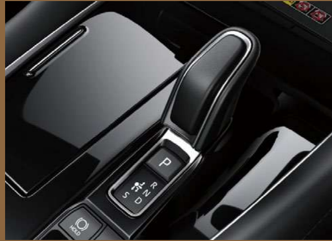
Automatic - CVT

From sheer comfort to precise control, the Alphard excels at delivering seamless performance for the most enjoyable rides.