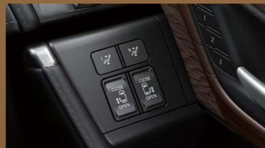
Hospitality driver's seat switch