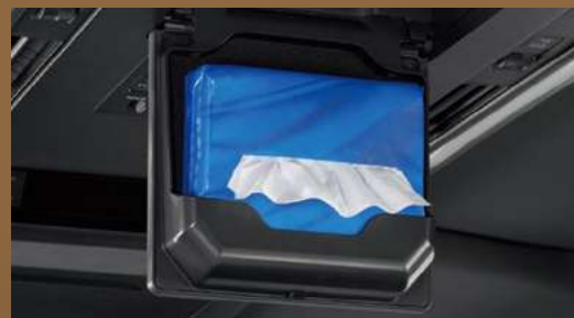
Ceiling storage box