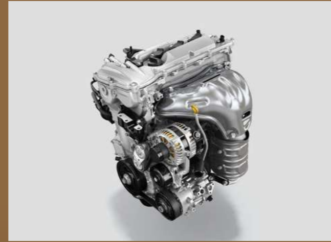
2.5L 2AR-FE engine and hybrid 2.5L A25A-FXS engine