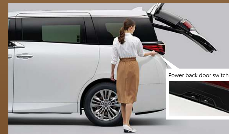
Power tailgate (with tailgate easy closer, anti-pinch function, stop position memory function, power tailgate switch (vehicle side, tailgate bottom))