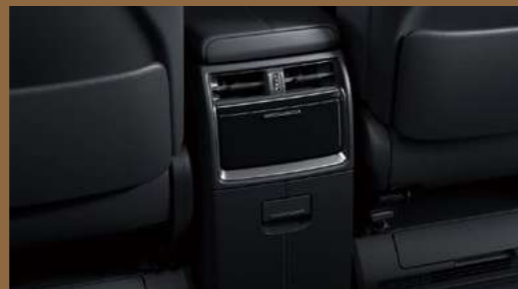
Rear seat console vent Spending time in the back seat is now even more comfortable.