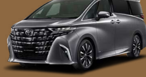
PRECIOUS METAL (1L5)