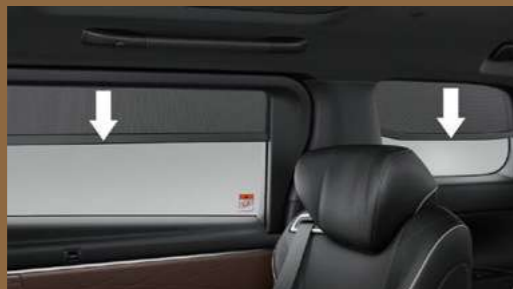
Power side sunshades for rear seats (sliding door glass, rear quarter glass)