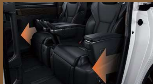
Rear heater air curtain A rear seat space that eliminates the need for a knee blanket. The rear heater outlets are set on the left and right