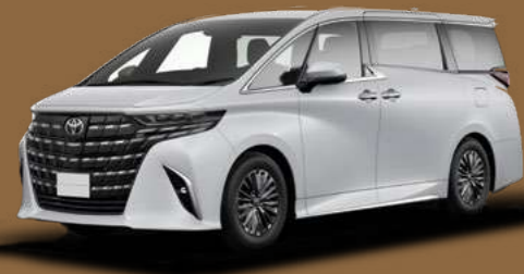
PLATINUM WHITE PEARL MC (089)