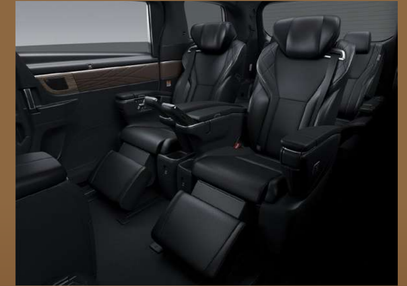
Executive Lounge Make your journey a blissful one. Enjoy a unique moment.