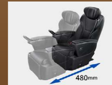
Power Long Slide [World's first *] Comfortable sliding operation.