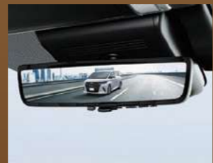
Digital inner mirror