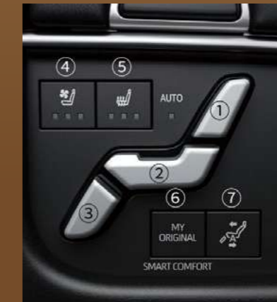
Seat operation switch Intuitive seat operation. Seat operation switches are located on the inside of the armrest. Intuitive shape allows blind operation. [1] Reclining [2] Slide/tilt [3] Ottoman [4] Ventilation [5] Heater [6] Smart Comfort [7] Neutral position