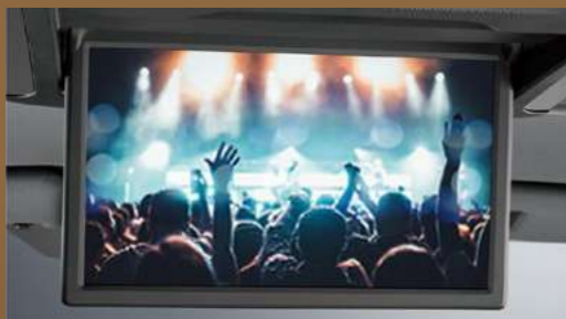
14-inch rear seat entertainment system