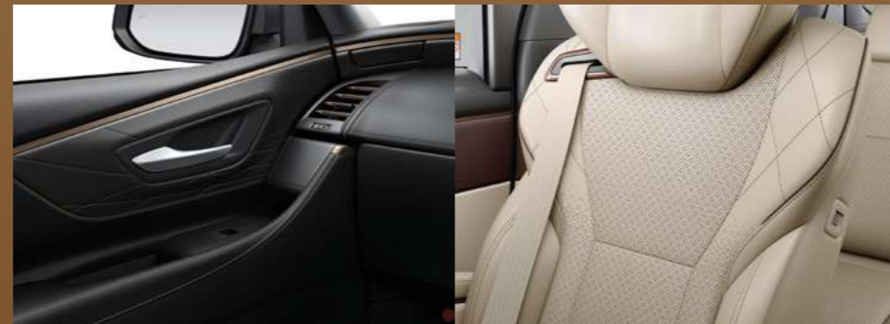
NEUTRAL BEIGE (41)

Note: Some features are not available in your region