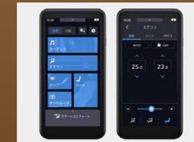
Rear multi-operation panel (detachable) A variety of functions can be operated with just a touch of a finger.