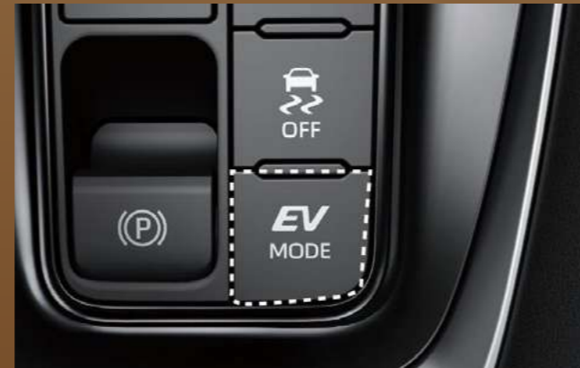
EV drive mode * / Eco drive mode

Achieving both excellent driving performance and low fuel consumption.