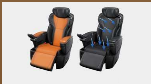
Comfortable heated seats + ventilation seats (front and second row) Attention to detail creates a relaxing time.