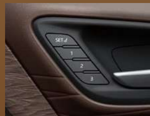
Microcomputer preset driving position system