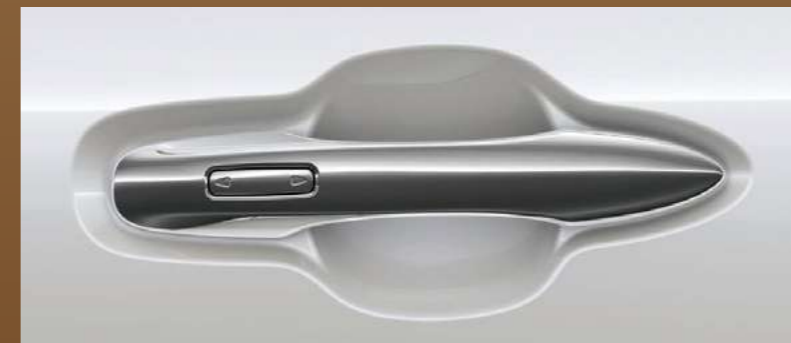
One-touch seesaw switch