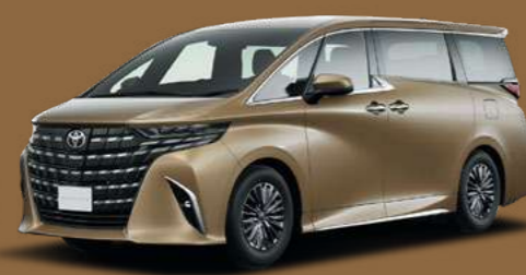
PRECIOUS LEO-BLOND (4YZ)