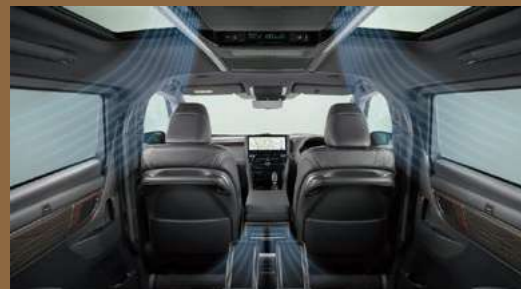
Fully automatic air conditioning with independent temperature control for the front, rear, left and right.